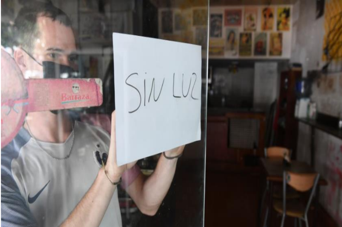
Store in the center of Parana without energy.