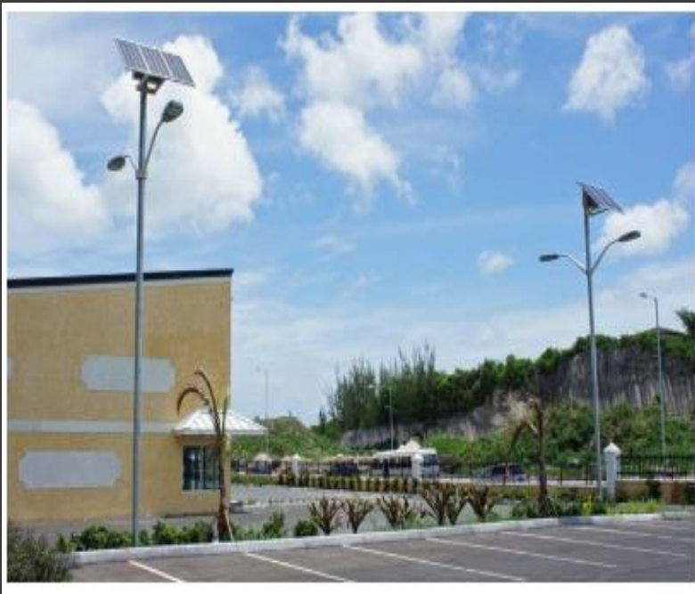
Streets and Roads